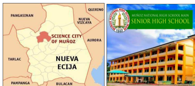
Fig 2: Map of Science City of Muñoz and Muñoz National High School Main SHS Building

The study was conducted in Muñoz National High School Main Senior High School, a public secondary school situated in Brgy. Bantug, Science City of Muñoz, Nueva