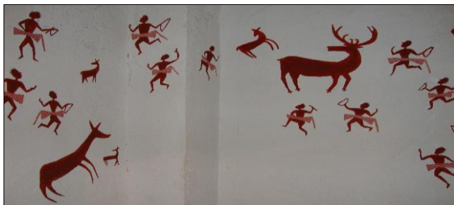
Fig 2: Part of a deer hunting scene depicting long-legged dogs identified by many authors as sighthounds (Saluki type). Archaeological site Çatalhöyük.

Archaeological findings and depictions discovered at the excavation site of Çatalhöyük in western Anatolia date back to approximately 5800 BCE. These findings include scenes of deer hunting with long-legged dogs that can be identified as sighthounds (Шритт, 2009) [5].