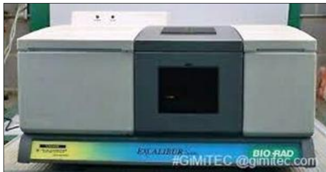
Fig 1: Bio-Raid Excalibur Series model FTS 3000 MX spectrophotometer