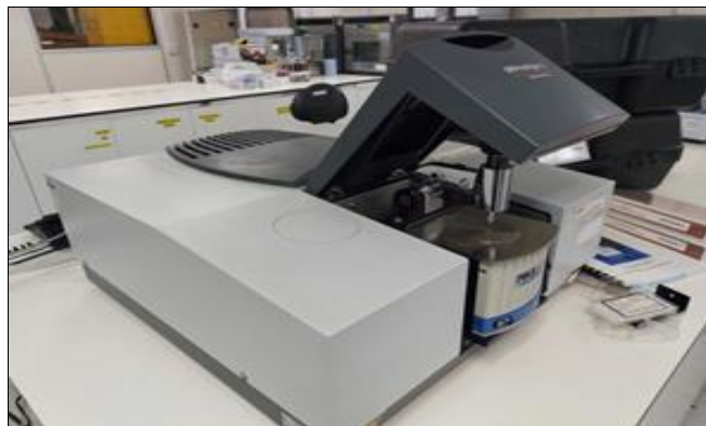
Fig 1: ShemadzuIRPrestige-21 Spectofotometer