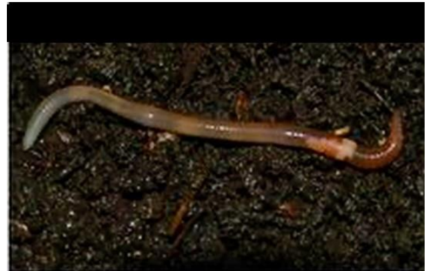
Fig 3: Lateral view of Amyntas tokioensis

For age classification formula explanation, see Reynolds et al. (1974) [30] or Reynolds (2022) [27].