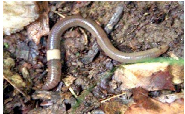
Fig 2: Dorsal view of Amyntas agrestis

Amyntas agrestis 0-0-34 (Fig 2), Amyntas tokioensis 0-0-9 (Fig 3).