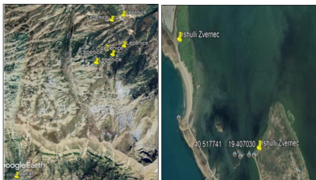
Fig 1: Orthoptera collecting stations

The accumulated individuals were determined taxonomically in laboratory, observing with magnifying