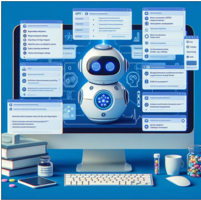
Fig 3: ChatGTP in medicine

AI analyzes student performance, identifying areas of strength and weakness. With this information, you can tailor the curriculum in a personalized way, providing additional resources or specific challenges based on individual needs. This ensures that each student reaches their full potential [11-14].