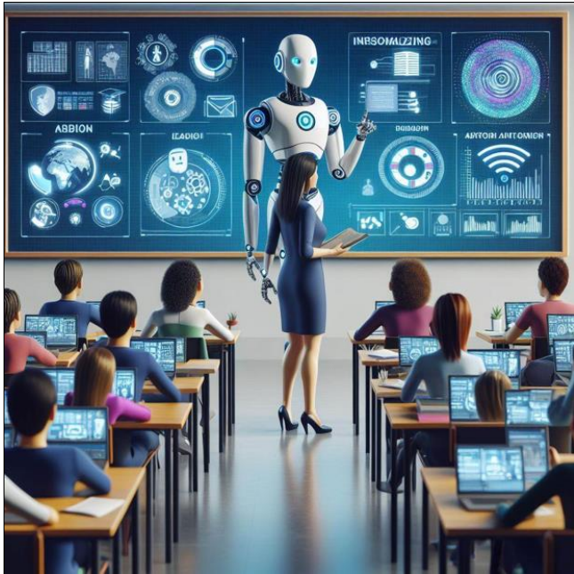
Fig 1: Artificial intelligence

length.” Decades later, Ada's vision is a reality thanks to Artificial Intelligence (AI). But the founding moment of “artificial intelligence,” both the term and the field of study, is a conference at Dartmouth in 1956 organized by John McCarthy, Marvin Minsky, Claude Shannon and Nathaniel Rochester. In it, the organizers invited about ten researchers to formalize the concept of artificial intelligence as a new field of scientific study. Pioneers of AI, four of the attendees were later awarded the Turing Award for their contributions to AI [1-2].