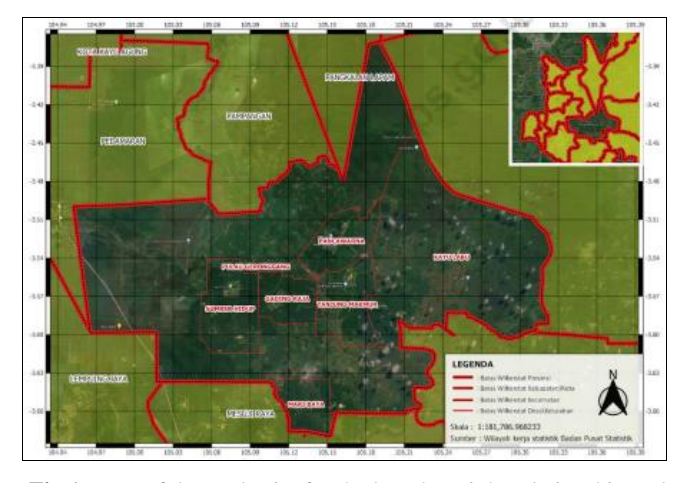
Fig 1: Map of the study site for the length-weight relationship and condition factor of Notopterus notopterus (Pallas, 1769) from East Pedamaran Sub-district, Ogan Komering Ilir Regency, South Sumatra, Indonesia

This research was conducted in the Floodplain area of Kayu Labu Village, East Pedamaran Sub-district, Ogan Komering Ilir District, South Sumatra, Indonesia (Fig 1). East Pedamaran Sub-district is one of subdistricts in Ogan Komering IlirRegency which distance about 72 km to capital of regency. It is located in south east capital of regency. East Pedamaran Sub-district has 10 meters from surface of sea level, and total area is 671.11 km<sup>2</sup>.